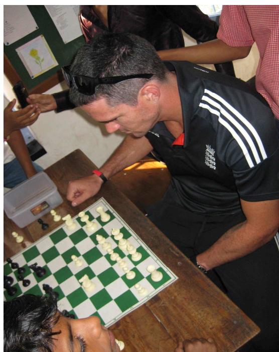
KP1 moves to the chess room